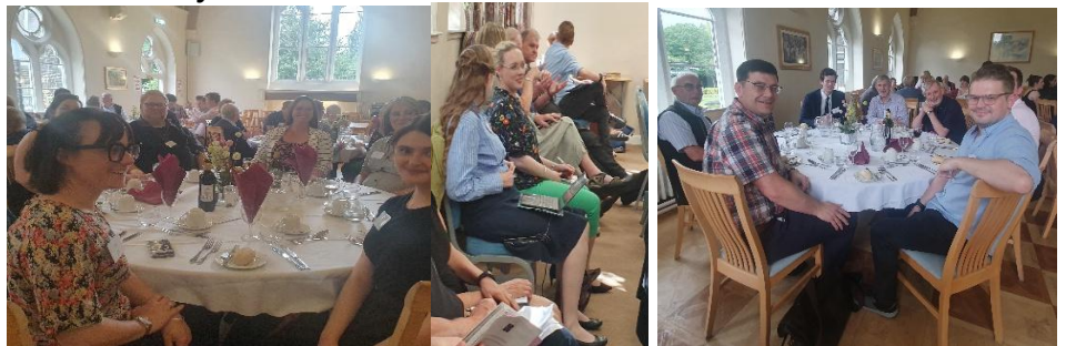
Delegates enjoying the 66th annual conference this year.

A call for papers will be circulated in the new year and registration will open in mid-May.